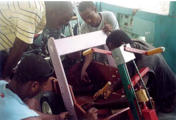
Friends assemble the PET for Wisland