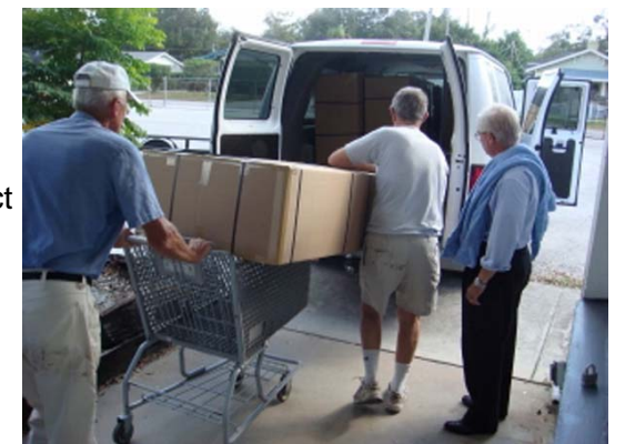
Volunteers load up the packed boxes of PETs to be shipped to Ghana, Africa