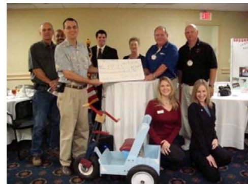
The East Tampa Rotary presented $1,500 to the PET Project.