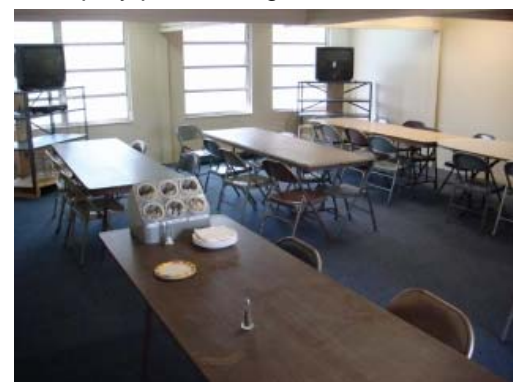
The new meeting room that was added to the workshop to be used for orientation of new volunteers, team building activities, and fellowship.