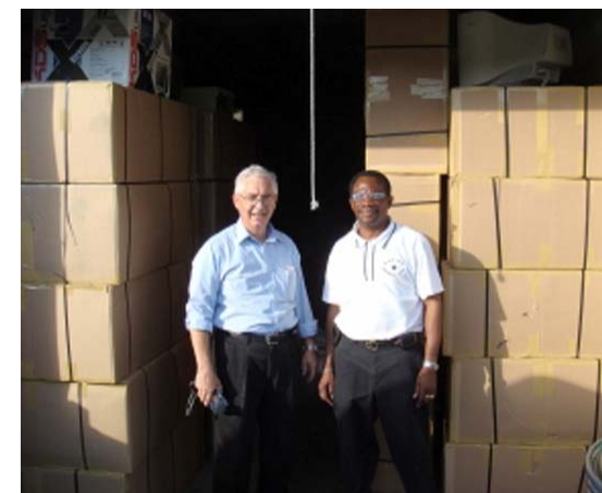
A full truck carrying the 26 PETs to be shipped to Ghana, Africa

A fully packed box of an adult PET along with other supplies to be shipped overseas