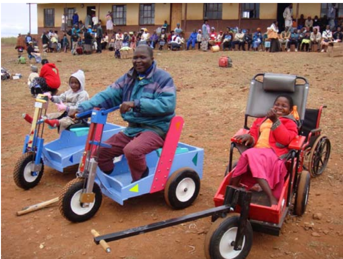
Above, a Swaziland man receives a hand-cranked PET. At left, a Swaziland woman receives a PULL PET.

We are wondering what might be a schedule for another container of PETs. We would like to start planning; we probably need to request that half the container be PULLs. We praise God daily and thank Him for the piece of the puzzle you have played in delivering effective physical and spiritual assistance to the people of Swaziland." ■