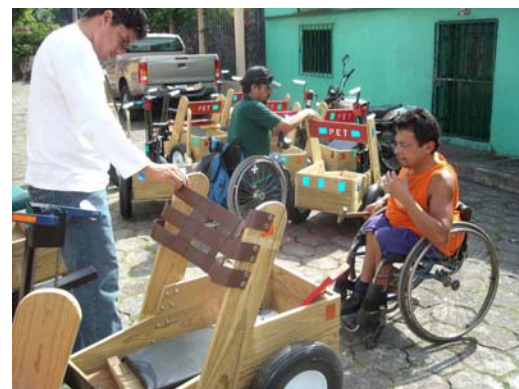
The new leather backs give more comfort and leg room to the PET.