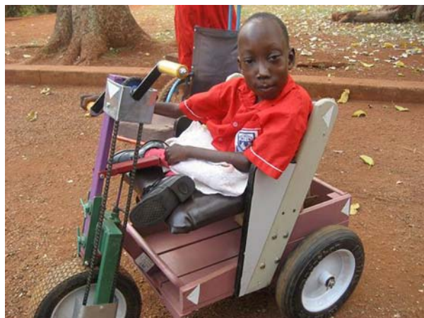
A boy in Jinja, Uganda that received a PET from the Kelly Green Evangelistic Association team trip.