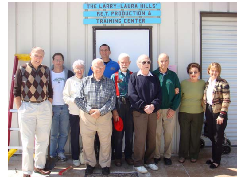
Tampa PET volunteers visit the new Penney Farms PET Workshop

Penney Farms is unique in that it is one of the few retirement communities in the country that is built upon the philosophy that every resident should be able to volunteer in some area. This allows them to keep their costs low as those residents with specialized skills help maintain the community by using their skills and knowledge in everything from lawn care to health care.