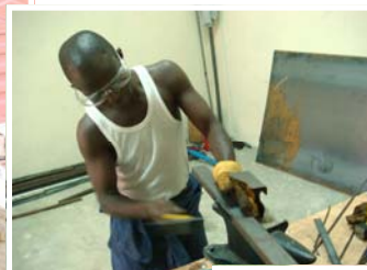
Bending chain guards of sheet metal with a hammer