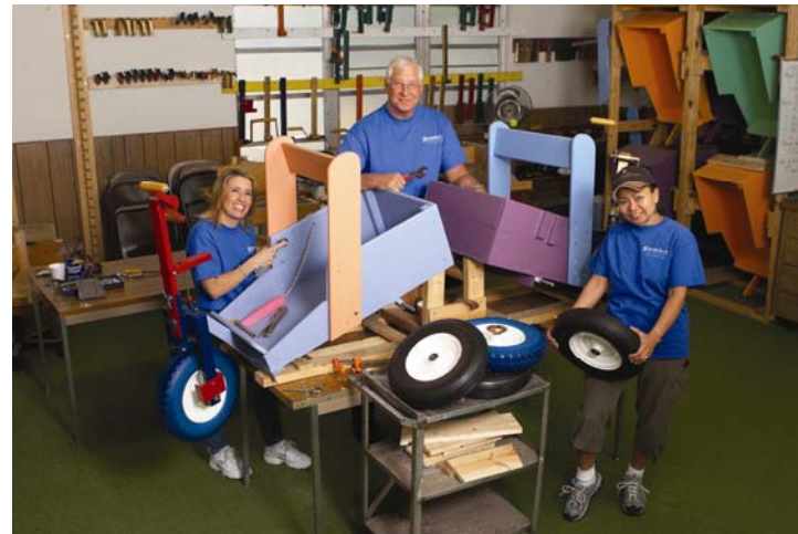
SEC volunteers at the Tampa workshop

Seminole Electric Cooperative has sent groups twice from their office staff to volunteer in the production of PET wheel chairs in the last six months. They have helped in many facets of the production from assembly to painting and packing. The group is committed to serving in the local community and already sees the results being felt around the world. Other company groups, church Bible studies, youth, colligate, and civic organizations having been making a difference since the beginning of the Tampa workshop. This hands on activity builds teamwork and relationships for all those involved. Call or email Tampa PET if you would like to arrange a time for your group.