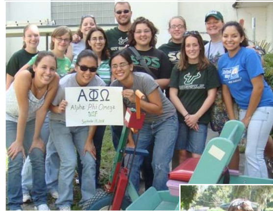
Left: Alpha Phi Omega