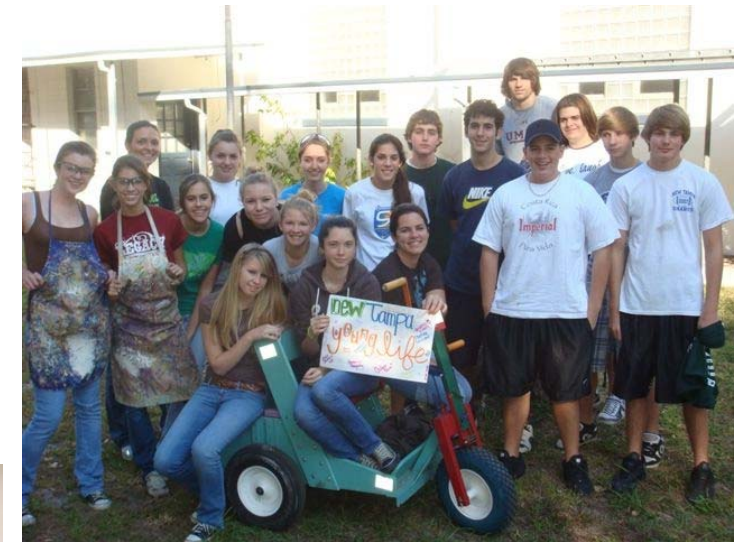
Above: New Tampa Young Life See more group pictures inside!

Every Saturday at least one group, and many times two groups, are hosted at the workshop. Many of the groups are students from local high schools and universities. Only with their help was it possible to accomplish producing the 200 plus units this year. Many thanks to them and everyone that came to serve. Here are photos of some of these groups.