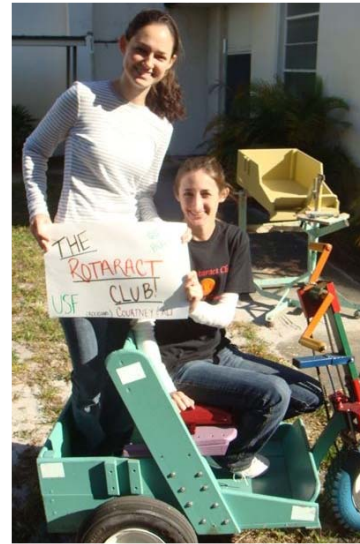
Above: The Rotaract Club