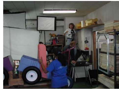
Above is a picture of the camera crew that came into the Tampa workshop recently. Seminole Electric Cooperative held an employee work day at the PET this past year and are going to place it into their company's annual report.