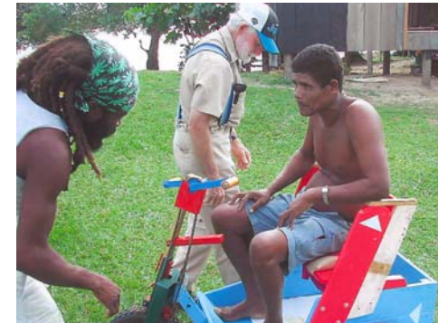
P.E.T. distribution in Honduras to child with spinal bifida (left) and adult with the bends from lobster diving (above).