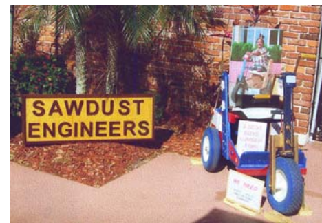
The woodworking group in Sun City, FL that provides the ready to use wood parts for assembly.