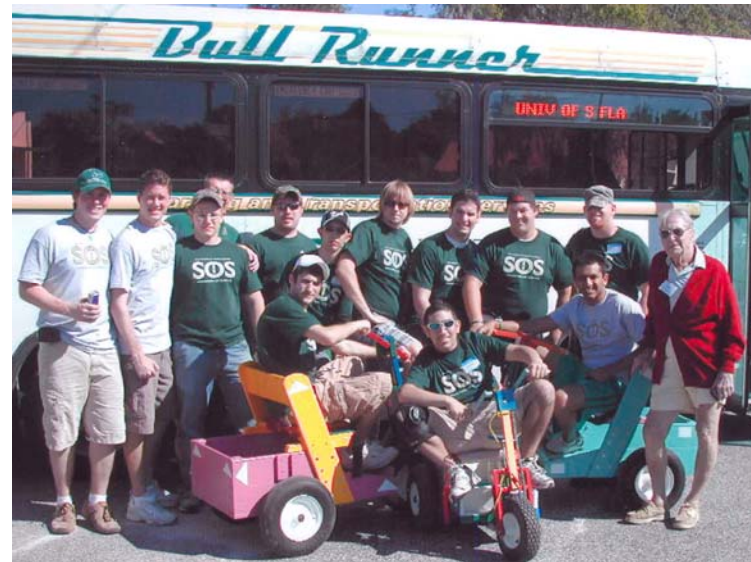
Stampede of Service, a group of student volunteers from the University of South Florida came to the workshop to assemble and pack the P.E.T. wheelchairs