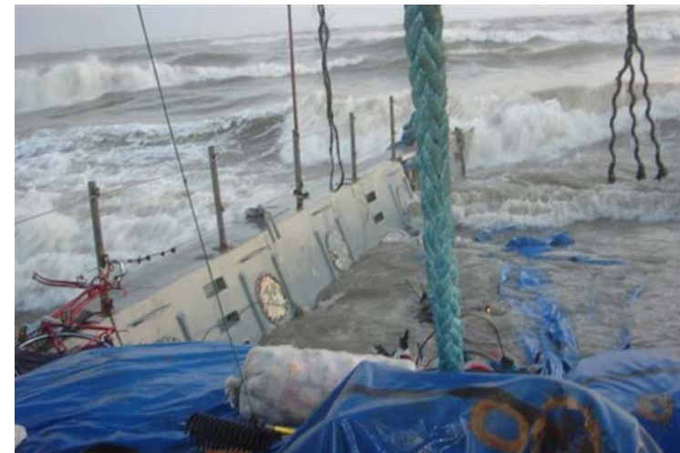
The front gate broken and all items lost at sea.